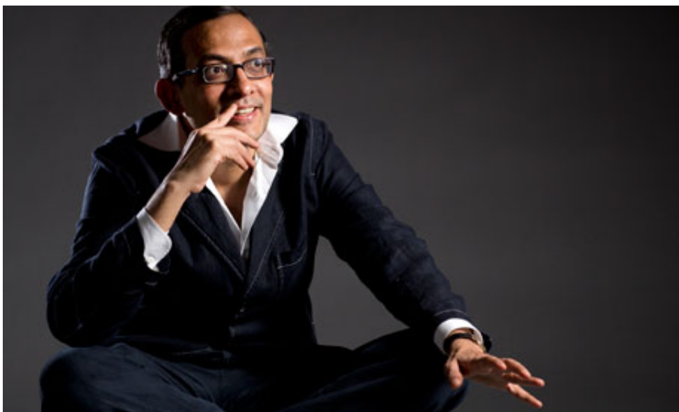
Abhijit Banerjee.

The Guardian, Sunday 22 April 2012 15.00 EDT