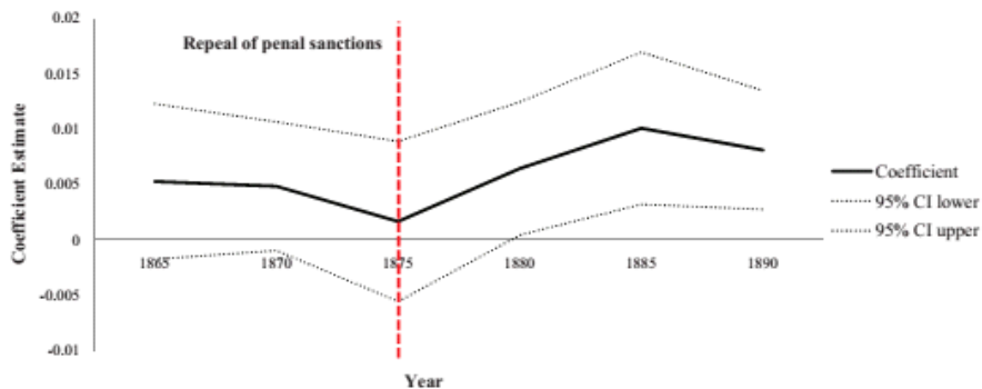
Wages in High Prosecution Counties Relative to Low Prosecution Counties, Before and After Repeal of Penal Sanctions