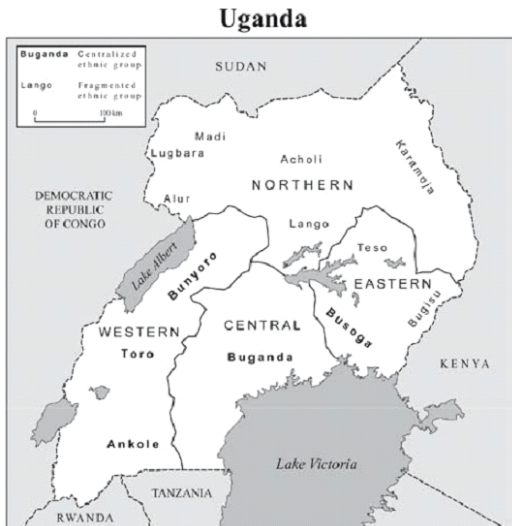
Map 1 Distribution of centralized and fragmented ethnic groups across Uganda regions