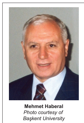
Mehmet Haberal